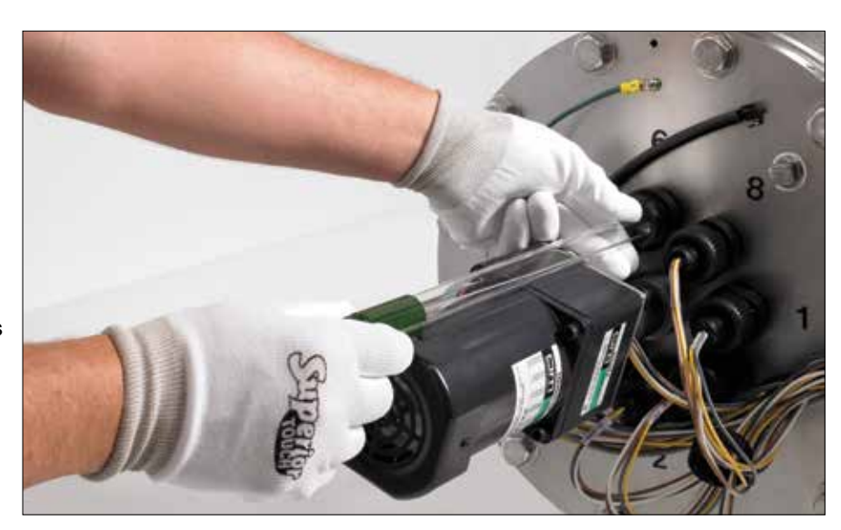
The TrojanUVFit lamps are easily replaced in minutes without the need for tools.