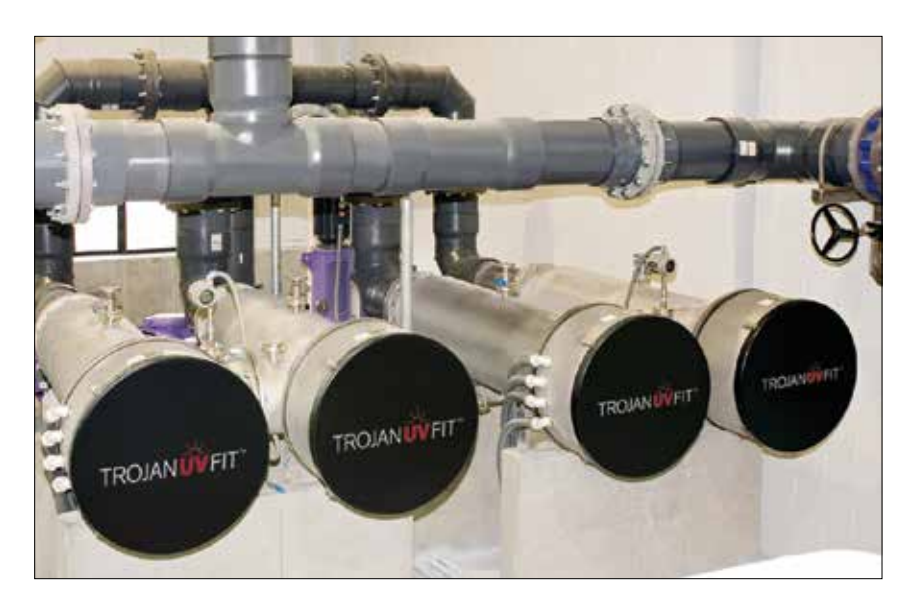
Chambers can be installed in parallel or in series for increased design and installation flexibility.